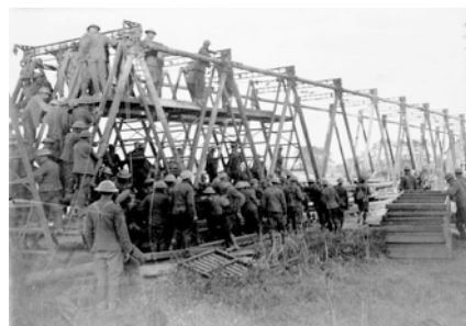
Canadian Combat Engineers building a bridge across the Canal du Nord