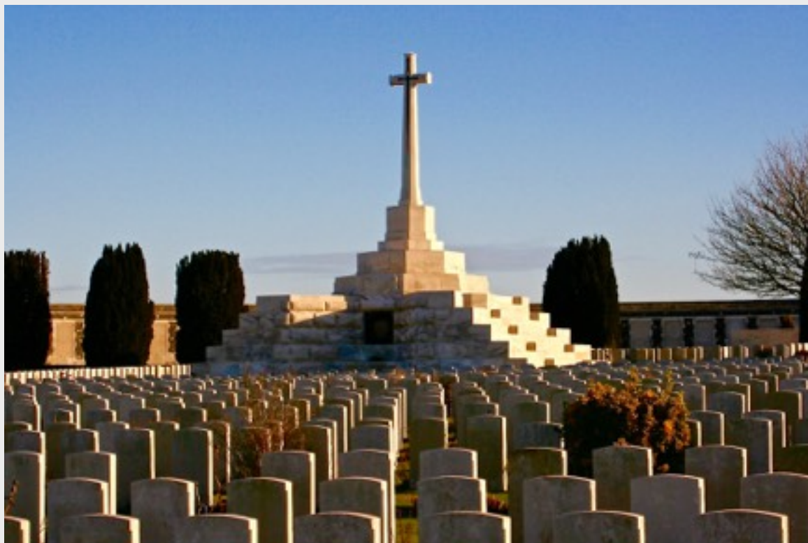
Tyne Cot Cemetery